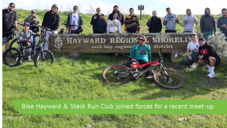
Bike Hayward & Stack Run Club joined forces for a recent meet-up