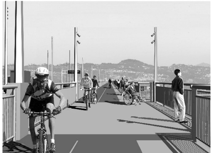
Photo-simulation of East Span pathway

Emergency Access - On the upper deck, the paths would allow emergency vehicles to reach critically injured motorists. Motorists involved in collisions would have a safe refuge through gates planned at 150-foot intervals.