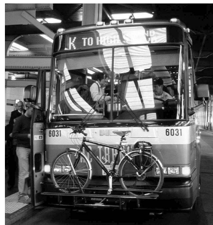
45' MCI bus at the Transbay Terminal

Our negotiations with AC Transit, Caltrans and the Bay Conservation and Development Commission (BCDC) have resulted in an agreement to replace the San Mateo Bridge "bike mitigation shuttle" with regularly scheduled bus service that will have a capacity for six bikes per bus, as specified by the BCDC. This service was contingent on the passage of AB 1409. Starting this winter, the 45' coaches on this route will be equipped with a front rack plus luggage-bay racks.