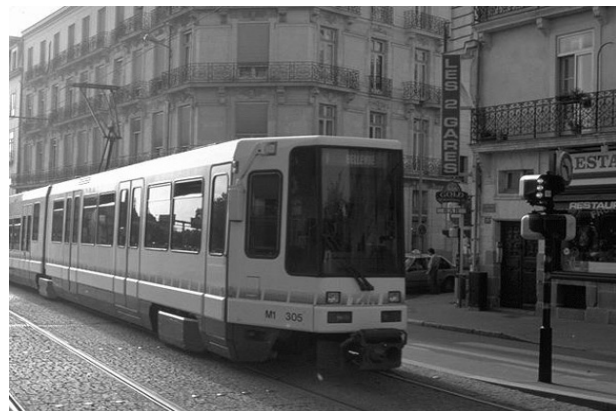
Nante, France - transit, housing and shops are all integrated in walkable neighborhoods with no barriers

Next time: neighborhood opposition to Smart Growth and what all this has to do with building bike-friendly cities.