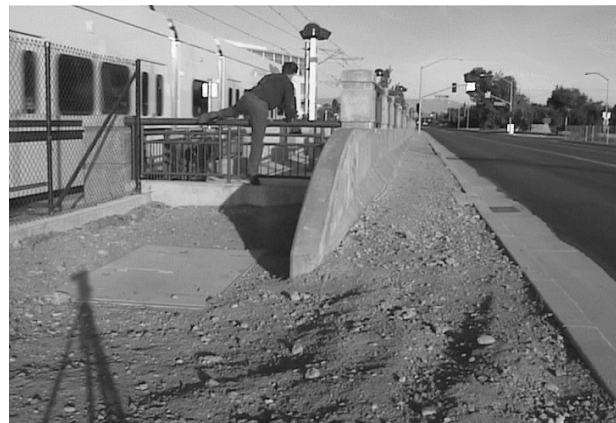
Moffett Station- The only way to enter the station from the main thoroughfare is to jump the railing! Also, note the lack of sidewalks.