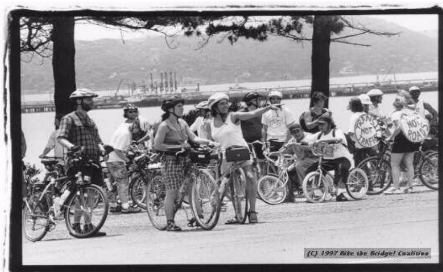
Cyclists protest for bike access on the Richmond-San Rafael Bridge