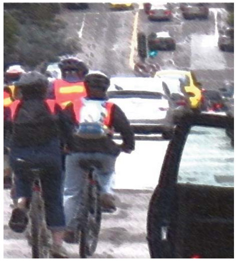
With the proper skills, riding with traffic can be much less stressful.