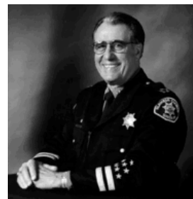
Alameda County Sheriff Charles Plummer

The EBBC's affiliated recreational ride clubs conduct organized rides on any day of the week. None of these rides have ever been staged with a parade permit. The Valley