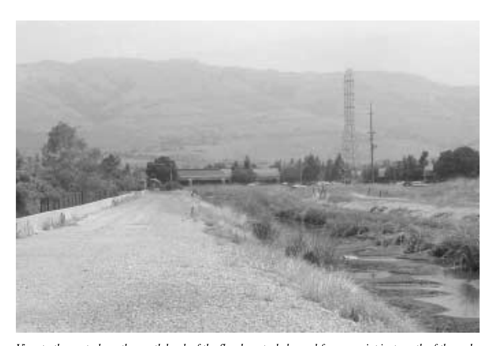
View to the east along the north bank of the flood control channel from a point just south of the end of Fremont Blvd. 1880 is in the distance; the gravel path on both sides of the channel is in good condition.