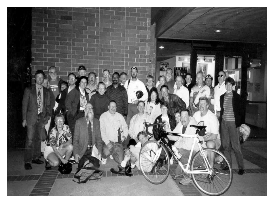
Delta Force Advocate Pedalers - All smiles following successful Antioch City Council session on April 28 to keep bike lanes on Lone Tree Way.

[Oil imports are also a major contributor to the US trade deficit.]