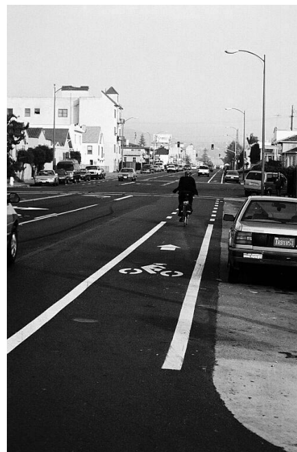
Bancroft Ave Road Diet

LONDON CONGESTION PRICING - London (England) has embarked on a bold scheme to charge commuters a $8 fee for driving into central London during peak hours. The plan had been severely criticized by motoring organizations and politicians across the political spectrum; but even critics concede the plan has worked better than expected so far.