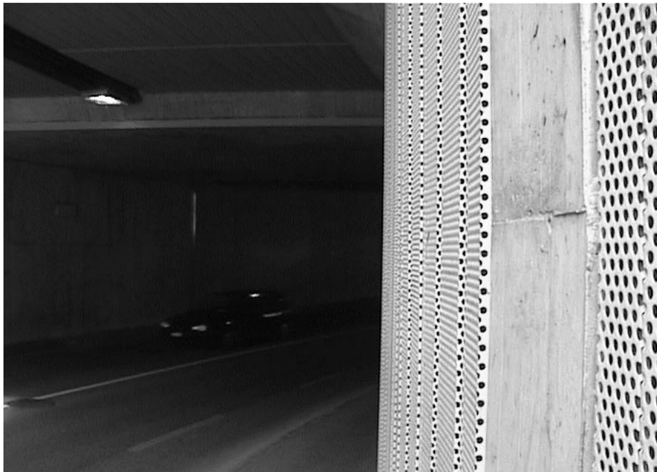
Montreaux, Switzerland: Sound-proofing in a railway underpass.