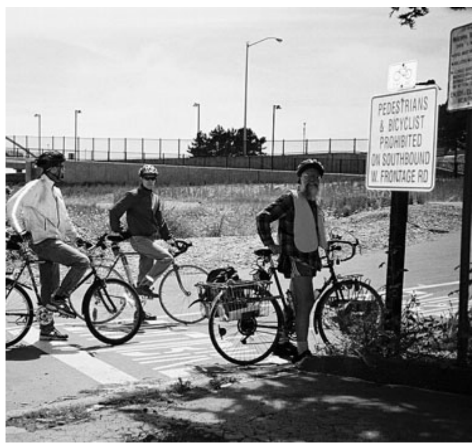
Coordination? Only three months after dedicating the Berkeley Bike/Ped Bridge, bicyclists are prohibited from traveling on the I-80 West Frontage Road between University and Ashby.