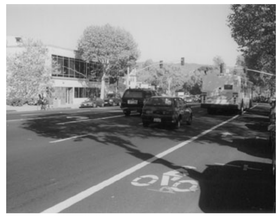
Grand Avenue with new bike lanes.

Submissions to ebbc-talk are archived at http://www.ebbc.org/list.html .