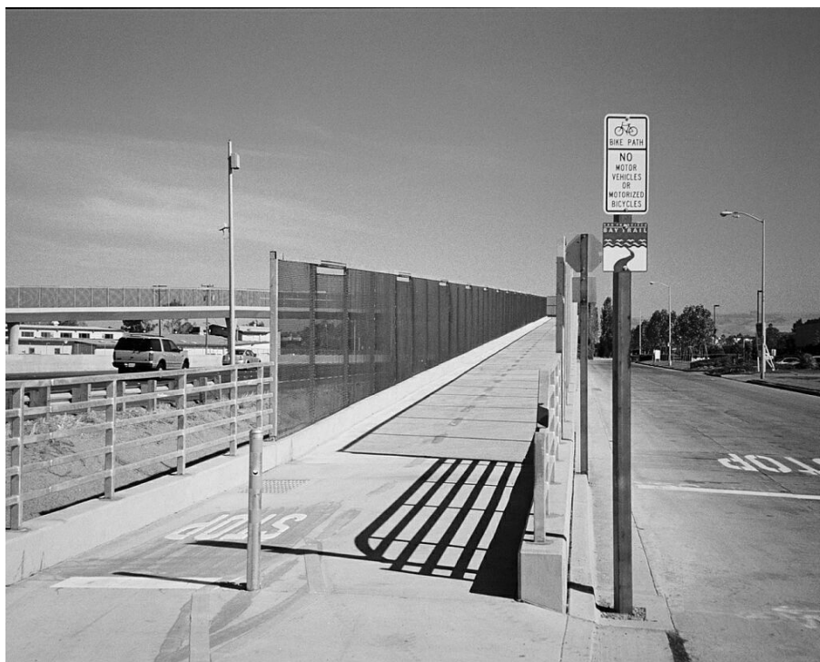
The new bike/ped bridge over SR92 connects Breakwater Ave with Point Eden west of Clawiter Rd.

Each of the projects we proposed will reduce congestion on one or more bridges by improving feeder routes to transbay transit hubs and/or reducing the risk of leaving your bicycle at a station. A "bridge nexus" is an essential argument for each of the projects. The nexus arguments will be legally necessary for each expenditure proposal