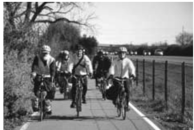
EBBC peloton, touring the I80 bikeway during the 2006 Retreat