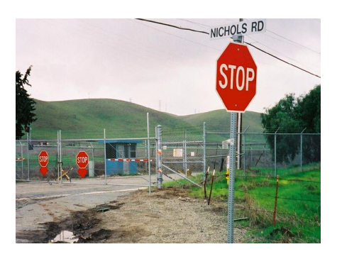
Left: The Delta DeAnza Trail terminates at Willow Pass Road on the Concord side of Willow Pass Grade. Bicyclists must continue to Concord on the freeway shoulder. Right: Gate at the Port Chicago Naval Weapons Depot in Bay Point. The only level connection between the Bay Area and the Central Valley, closed in 1995.