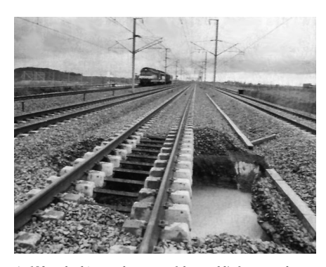
At 182 mph, this was the scene of the world's fastest and most spectacular derailment. It occurred on this TGV line in 1992 when, after a period of heavy rains, a sinkhole opened up under the tracks, possibly caused by a trench from World War 1. The TGV's articulated design kept the train from jackknifing or leaving the track bed. (see http://mercurio.iet.unipi.it/tgv/wrecks.html for more on the TGV accident history.)