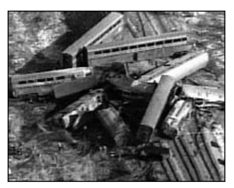
The infamous Bourbonnais, IL pile-up occurred when the train struck a truck at a grade-crossing, causing the train of aeral and smash into a nearby hopper car. II passengers were killed and 122 injured. No TGV passenger car has ever overturned in a grade crossing accident; not even in 1988 when train #736 hit a special road transport weighing 80 tons. And yet, according to the FRA, the TGV is unsafe.