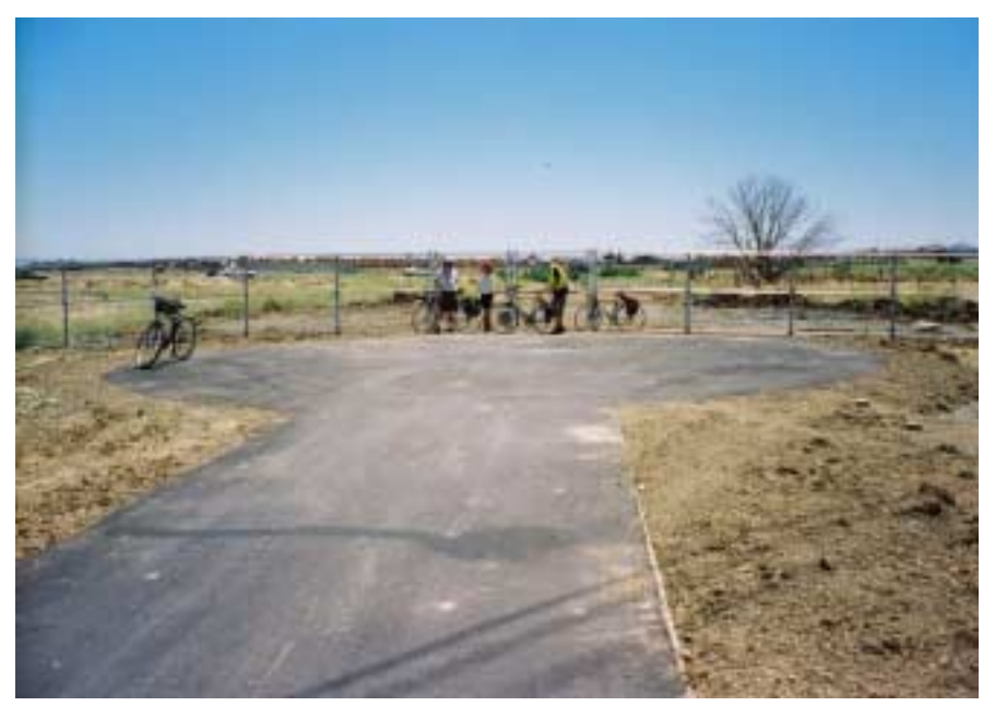
State Route 24 Bypass forms a barrier to the recently completed segment of the Mokelumne Trail in Brentwood.

Already, the "improvements" at an outlying shopping center on Lone Tree near a future interchange have conspired to make the street unfriendly to bicyclists. Each new occupied home in the area represents another family of