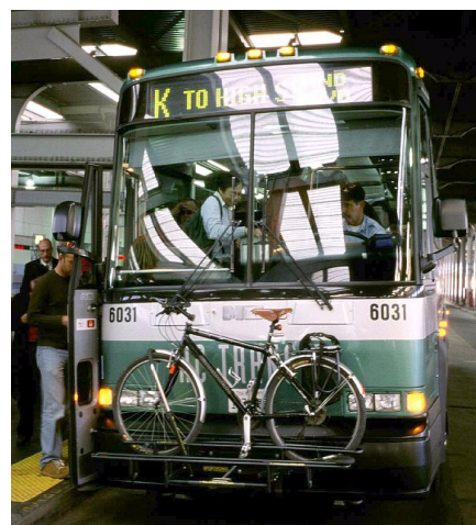
Transbay bicyclists who have relied on AC Transit's 45' MCI coaches over the past two years were stranded when the latest "Governor's Congestion Relief" additions to the fleet appeared without bike racks.