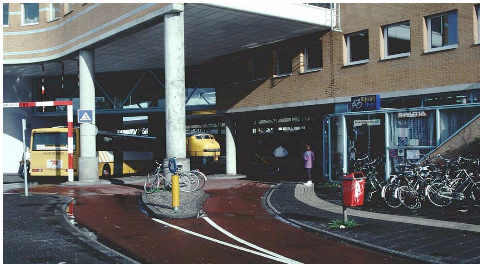
Lower image: A bike path running directly into the train station in Groningen, Netherlands. Safe bicycle access to transit has been highly successful in the Netherlands, Germany, and Japan and serves as a model for the Bay Area. SR2T would also fund projects to overcome barriers to non-motorized access, such as this bike/ped bridge built in Walnut Creek (upper image).