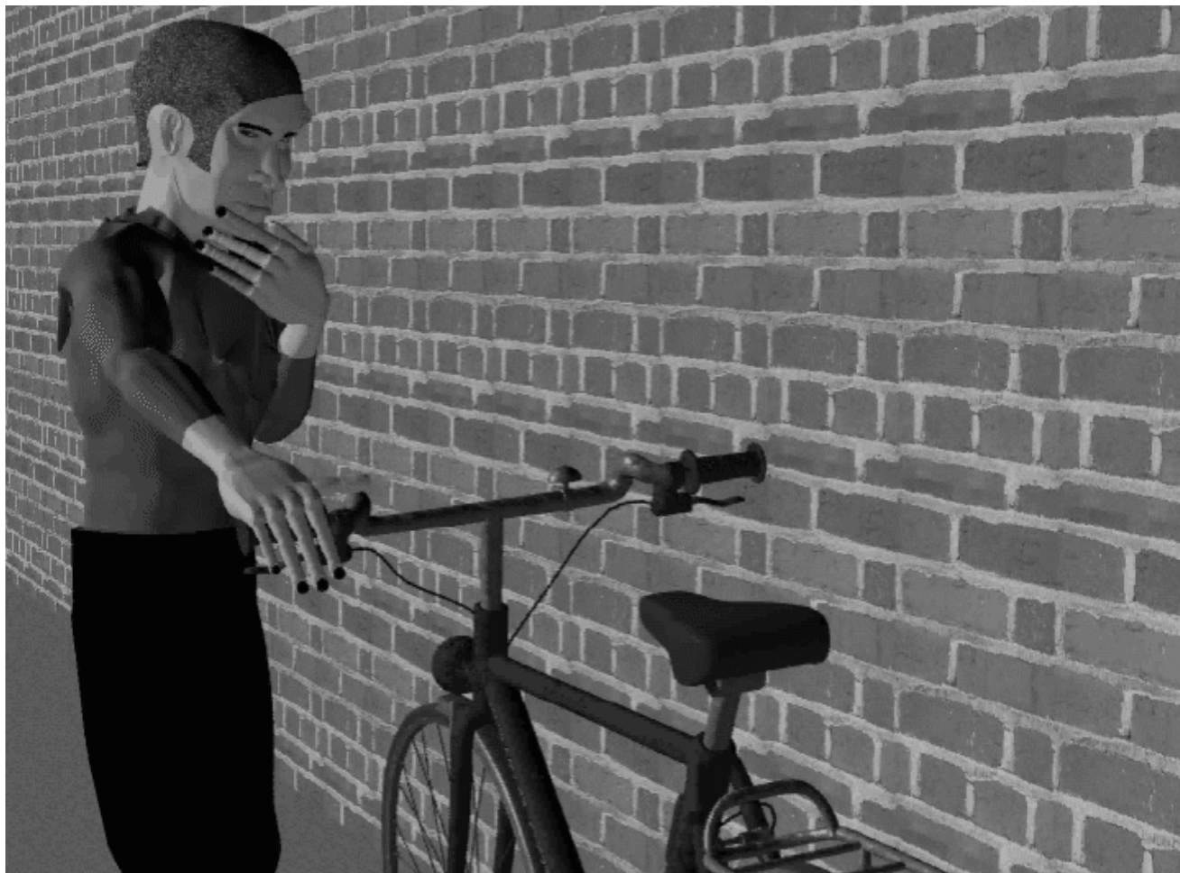
Scene from the computer-animated film Motion Sickness

NEXT MEETING begins at 7:30pm on April 15 (third Tuesday) at Oakland's Rockridge Branch Library, 5366 College Ave, at Manila. On the agenda will be reports on Fruitvale BART, Telegraph Ave, San Pablo's spending on streetscapes (not bikes), and what the upcoming Ozone plan revisions could do to enhance bicycle and pedestrian access and safety.