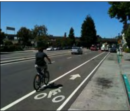
Bike lanes to BART stations getting funded through Measure B

Measure B for bike/ped projects. This money has funded bike lanes in Oakland on Market St, 40th St, and Lakeshore Ave, the Iron Horse Trail in Pleasanton, San Leandro Slough Bay Trail bridge, the Alamo Canal Trail under crossing of I-580 in Dublin, new electronic lockers at BART, pedestrian improvements in the Irvington District of Fremont, and the East Bay Bicycle Coalition's own bicycle safety education program. In addition, Measure B has funded nine bicycle and pedestrian plans, which all have identified numerous local bike/ped projects ready for funding by the new Measure B.