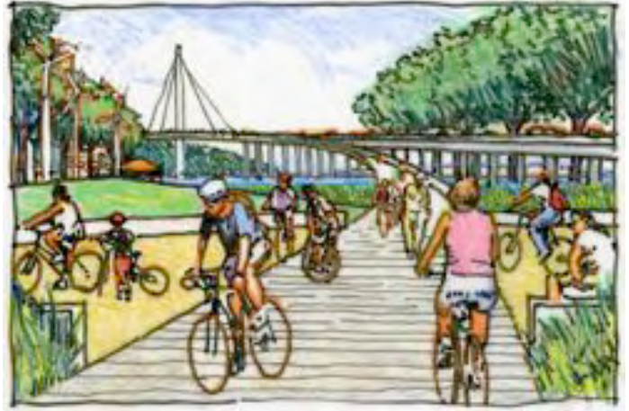
Gateway Park to the Bay Bridge Pathway: an important project for the new Measure B to fund