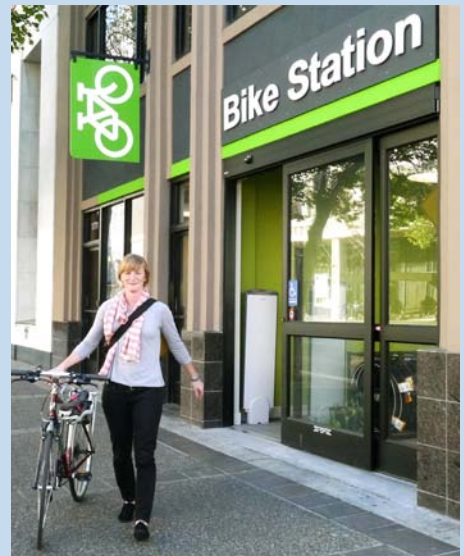
The Uptown bike station at 19th St. BART station is now open

This Bike To Work Day, Fruitvale, 19th St and Downtown Berkeley Bike Stations will all be hosting Energizer Stations. You'll also be able to join or