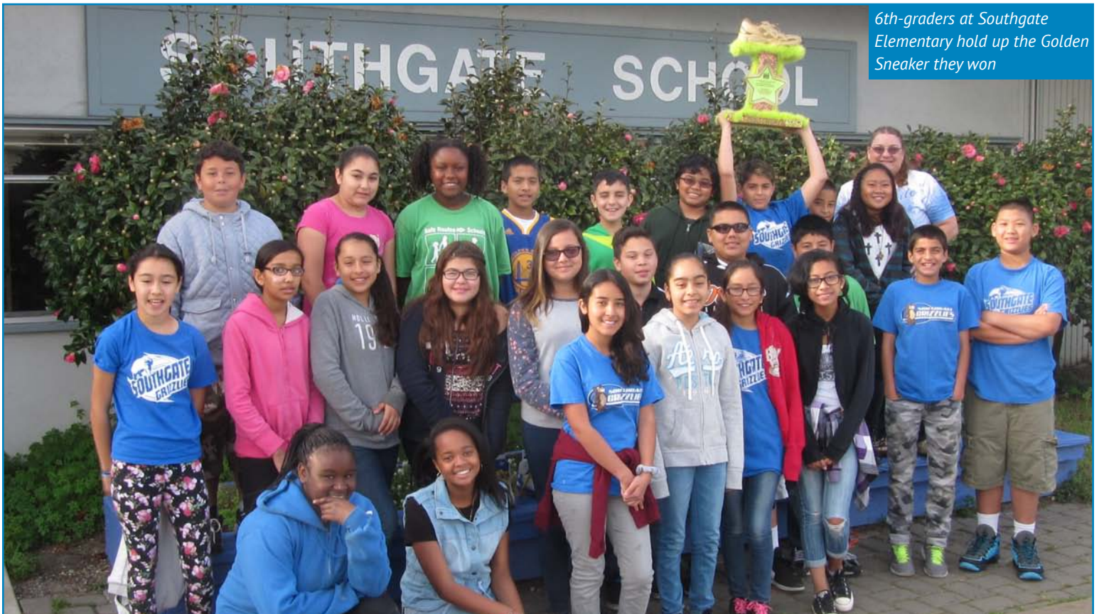
6th-graders at Southgate Elementary hold up the Golden Sneaker they won