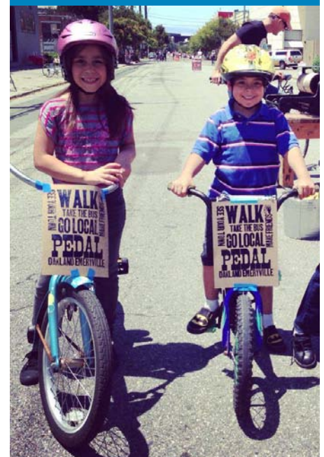
Kids having fun at last year's Love Our Neighborhood Day

Mark your calendars for the second Love Our Neighborhood Day, Saturday, May 30, a joint Oakland and Berkeley Open Streets event on San Pablo Ave between Ashby and Stanford Avenues. On September 20, Love Our Lake Day returns for a third year to Lake Merritt and promises to be the biggest yet, as Oakland's new mayor elevates the importance of transportation and place-making in Oakland. The biggest of them all returns October 18 to Downtown Berkeley. This will mark the fourth year Sunday Streets Berkeley fills Shattuck Avenue with car-free activities and fun.