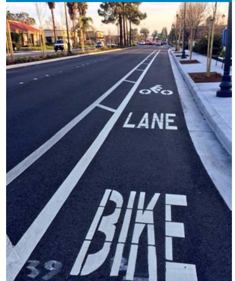
New buffered bike lane on Contra Costa Blvd

Bike East Bay is working with Save Mount Diablo, the Sierra Club, Transform, the Greenbelt Alliance, the Central Labor Council, Public