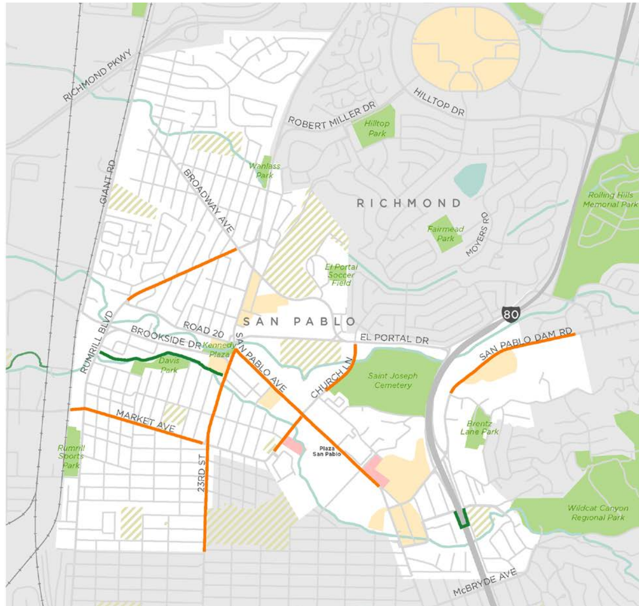
Figure 4-1: Existing Bicycle Facilities