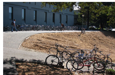
Bicycles locked to every available post on UC Berkeley campus.