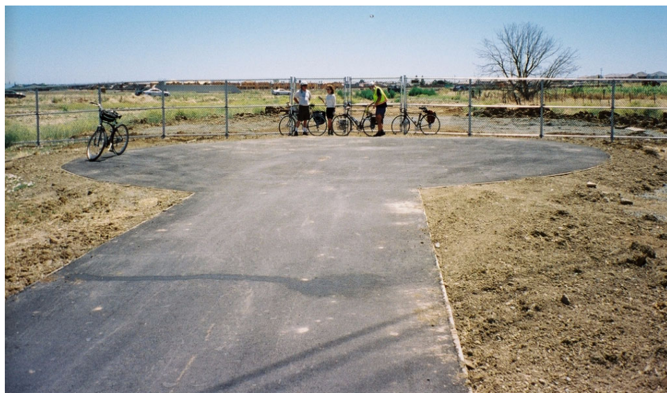
The bike stops here! Mokelumne Aqueduct path near the Antioch/Brentwood border has been completed to either side of the new SR 4 Bypass freeway for several years. Image of a 2005 site visit by EBBC and East Bay Regional Park District.

Despite overcrossing being required by environmental documents, SR4 Bypass Authority thumbed their noses at community access needs