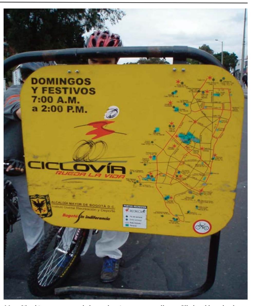
Maps like this one on a road closure barrier on a normally car-filled and busy boule-vard show the 75 miles of "ciclovias" on Bicycle Sundays in Bogotá, Colombia. Many roads are closed for 7 hours every Sunday.

Club cyclists in full kit (Colombians have a rich racing history and actively follow the sport), joggers and roller skaters were also