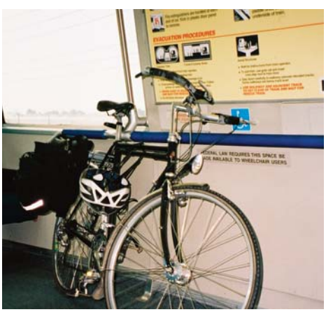
Above: an early BART 'Bike Space' grip bar, without the later addition of a folding seat.

BART has added a costly folding seat to the recent prototypes. The folding seat, different from the fold-down seat in wheelchair priority areas, represents about 80% of the project costs. When in use, the seat also usurps the bike space. Since the SR2T funding was awarded to improve bicycle access, especially for bridge corridor travel, EBBC joins disability advocates in calling for a simple, low-cost leaning pad instead of this new folding seat.