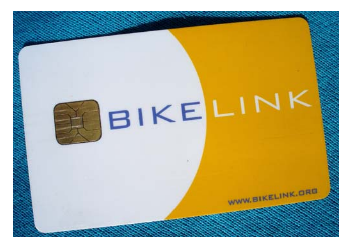
BikeLink cards are now available at EBBC's office for $20 or you can purchase them online at www.bikelink.org

Electronic lockers at Ashby (12), Lake Merritt (32), MacArthur (20), Rockridge (32), and West Oakland (6) BART stations were made possible by grants from the Bay Area Air Quality Management District's Transportation Fund for Clean Air. Twenty (20) more electronic lockers at MacArthur BART