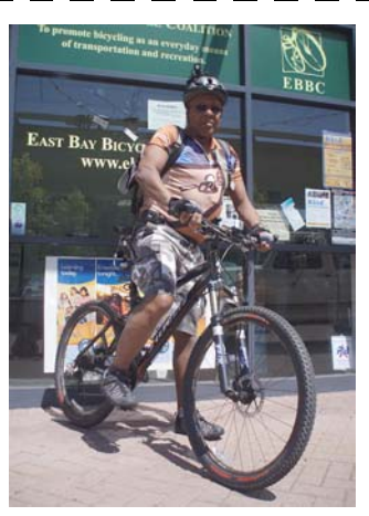
Norm's new ride was a good deal, thanks to EBBC's shop discount program!

EBBC Office at 3301 E12th St, Suite 143, Oakland, next to the Fruitvale Bike Station. April kept us busy attending over 20 events, rides, transportation fairs and City Council ceremonies. Our ongoing preparations for Bike to Work Day (BTWD) kept a crew of volunteers busy throughout the month. By