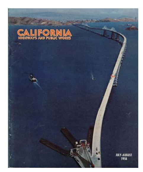
Ferry operation shown on 1956 cover of CA Highways & Public Works magazine.

Since BCDC's 2002 requirement that a new plan accompany the bridge work, advocates have bent to Caltran's demands for solid barriers and