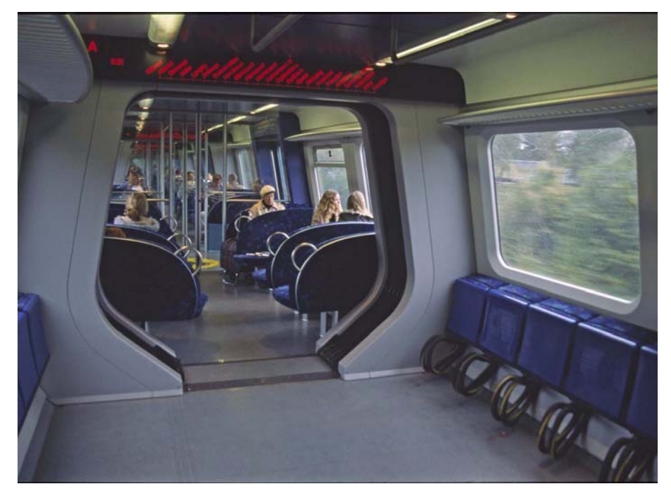
Danish s-Tog trains offer an open luggage area to accommodate bicycles, strollers, or passengers in folded seats. Our BART committee suggests that similar luggage areas be located at the middle door.