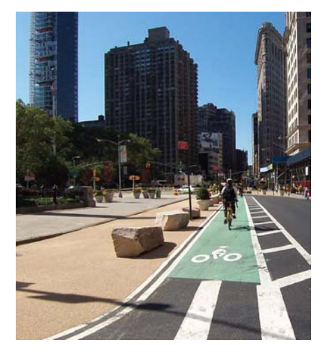
Madison Square, Manhattan is the first illustration in New York's new Street Design Manual.

Once again, the New York City Department of Transportation (NYCDOT) delightfully surprises the design community with another major leap forward in making city streets a public realm for all users (I can't tell you how odd it still feels to write that). As if the impressive, incessant roll-out of bike lanes, successful implementation of the "Select Bus Service", and the unprecedented changes to Time Square and its environs weren't enough to pique the imaginations of New Yorkers used to streets built for cars, NYCDOT has just issued their "2009 Street Design Manual".