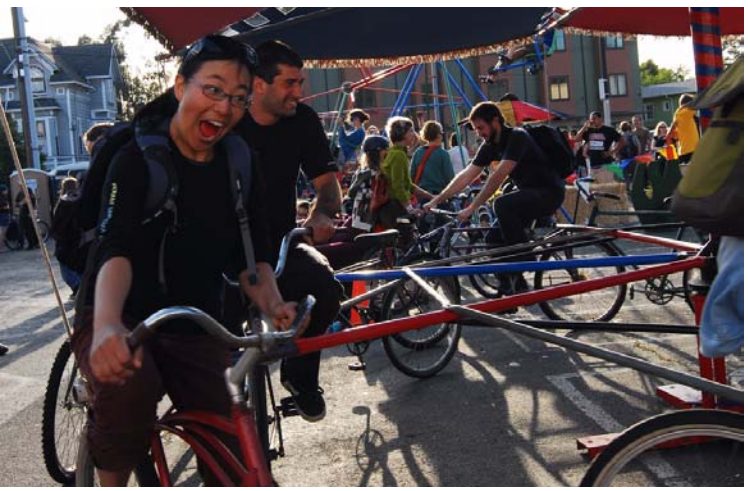
Crowds of bicyclists celebrated. (L.) It seems like whereever EBBC deploys parking racks, bicyclists follow. Cyclecide's Heavy Pedal Bike Rodeo offered fun rides for kids of all ages!