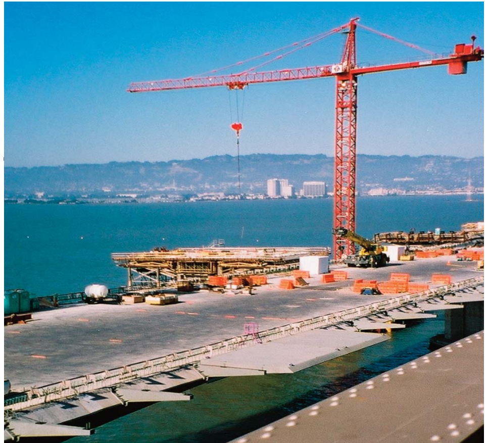
Initial deck installation of the Alexander Zuckermann Bay Bridge Path in July 2005.