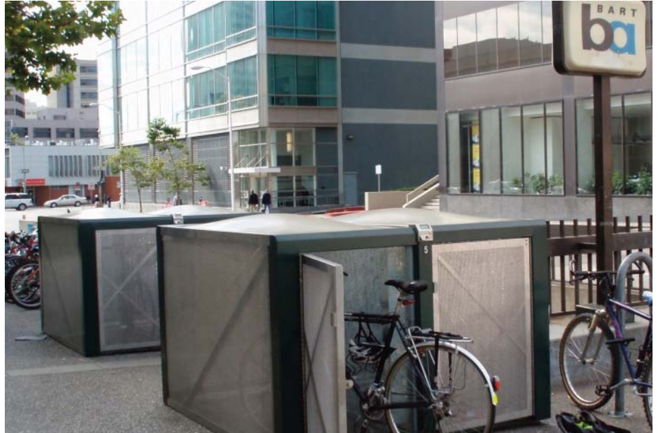
New on-demand eLockers have been installed near Oakland's 12th and 19th Street BART stations. 200 more eLockers are coming to BART stops by November, but will not be enough to meet the demand. EBBC is lobbying BART for additional eLockers.

The pent-up demand for secure bike parking at Oakland's downtown BART stations has led many bicycle commuters to embrace new technology.