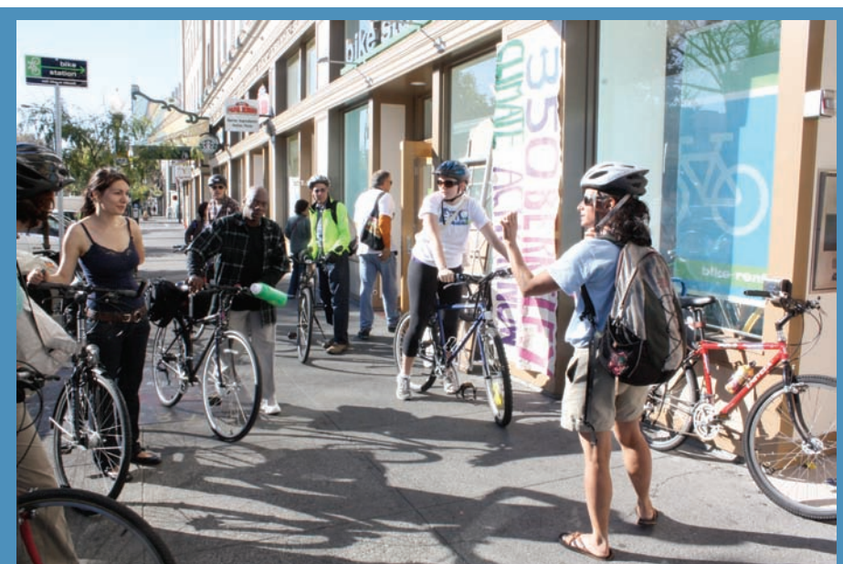
Kicking off the 1000 Cyclist Campaign on 10/10/10

family member, friend, co-worker, you perhaps. Think back to when you started – do you remember all of the little details you figured out, all of the little barriers you had to overcome, the gradual process by which cycling transitioned from a novelty to part of your daily routine? You can help others find their way through this process in a variety of ways. For example;