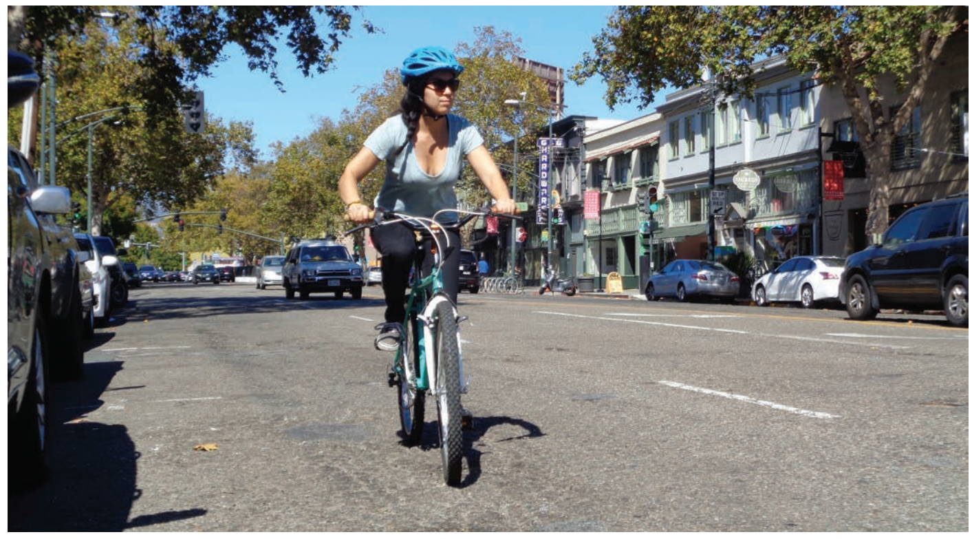
Many intersections along Telegraph Ave. are undeveloped, like at 29th St. where the bike lane ends and people on bikes are tossed out into wide travel lanes. Abrupt changes in lanes make the street harder to navigate for drivers and people on bicycles alike.

[i] "Telegraph Ave Progress Report" http://www2.oaklandnet.com/oakca1/groups/pwa/documents/report/oak062598.pdf