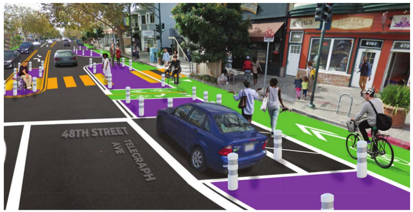
OakDOT's proposed design for a protected bike lane on Telegraph Ave.