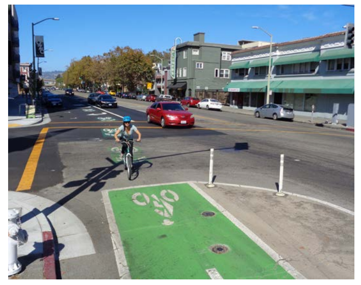
Since the introduction of protected bikeways and crosswalk improvements in 2016, KONO has seen a 9% increase in retail sales, and no pedestrian crosswalk collisions for the first time in 5 years [i].

This stretch of Telegraph Ave. at 49th St. is notorious for the terrible quality of pavement. Protected bike lanes, timed traffic lights, transit improvements, efficient loading and drop offs can make this section of Telegraph Ave. more comfortable for everyone.