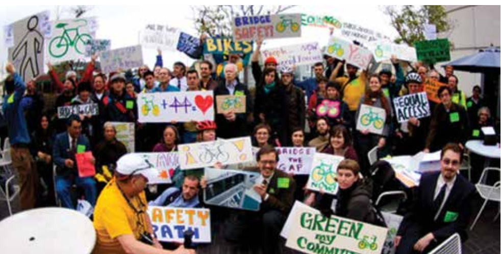
Activists push for bike and pedestrian access on the Oakland-San Francsico Bay Bridge.