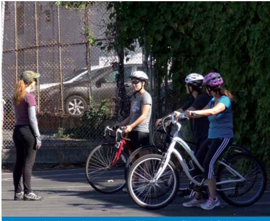
Instructors and students work together to learn during a Learn to Ride class in Berkeley.