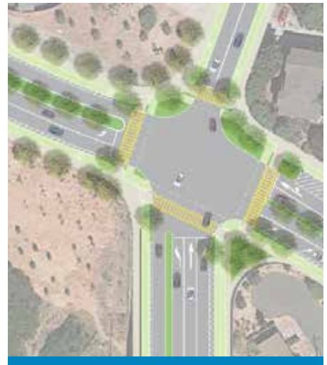
Proposed protected intersection at Bayview Ave and Carlson Blvd.