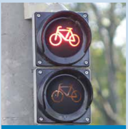
An example of a bike traffic signal

It took a lawsuit to force Caltrans to consider safety impacts on bicyclists. Ten years ago, Caltrans claimed opening a fourth bore for the Caldecott Tunnel would have no traffic safety impacts to bicycling on busy Telegraph Avenue and Broadway. Bike East Bay joined neighborhood groups in filing a civil lawsuit against Caltrans, resulting in $10 million awarded to Berkeley and Oakland for walking and bicycling improvements. In the coming months, we will see the installation of bike activated traffic signals at Ashby and Hillegass Avenues in Berkeley, uphill bike lanes on Tunnel Road, and a protected cycle track on upper Broadway at the Highway 24 onramp.