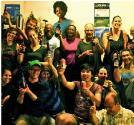
Volunteer beer tasting night with New Belgium