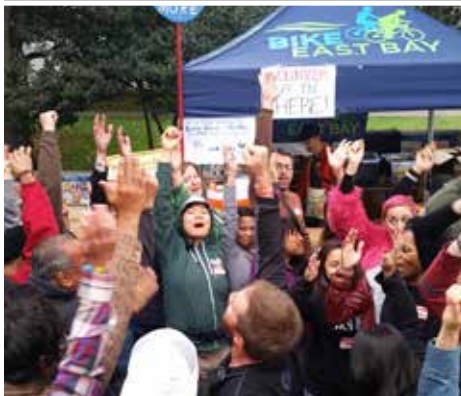
Volunteers at Clips Beer and Film Tour.