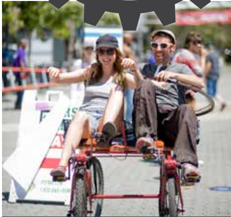
Bicycle Built for Two at PedalFest.

Nothing says summer in the East Bay like the chance to gather with friends old and new in the sun for bike fun. Thanks to everyone who came out to our 4th annual Pedalfest in Jack London Square, to our first ever Legends of Cycling event, to the first Berkeley Clips Beer and Film Tour.