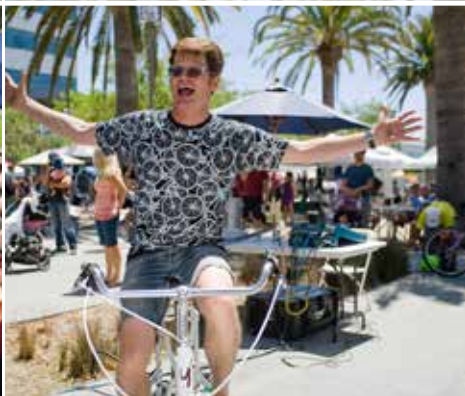
PedalPowered Fun at PedalFest.