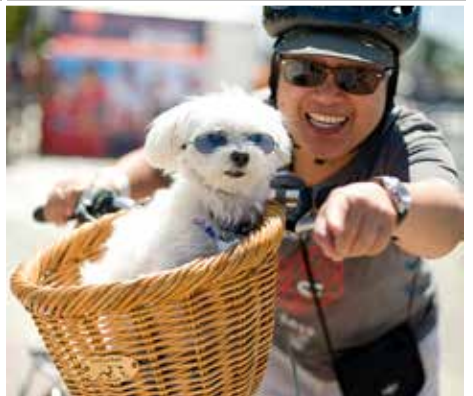
Bikes and dogs at PedalFest.