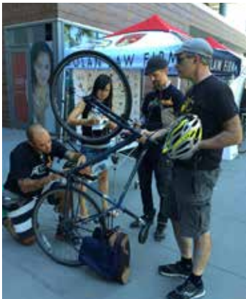
Over 250 bikes were registered at Pedalfest at our bicycle registration booth, sponsored by Dolan Law.