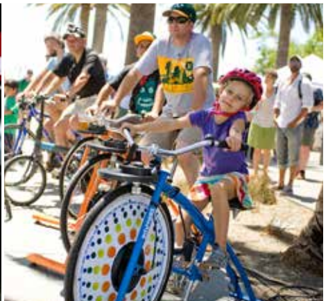
Pedal Powered Fun at PedalFest.