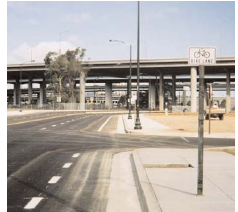
The (undamaged) MacArthur Maze, viewed from the Mandela Parkway bike lane linking West Oakland BART with Emeryville and Berkeley.

Bicycling on surface streets in Oakland, Berkeley, and Emeryville just got a bit trickier. If you ride on surface streets being used as detours around the damaged Maze, watch for distracted drivers who may be on unfamiliar routes. Expect drivers to make more frequent sudden turns and lane changes. Use extra caution, be more visible than usual, and ride predictably. (To improve your on-street cycling skills and your confidence, take a free Street Skills course this month.)