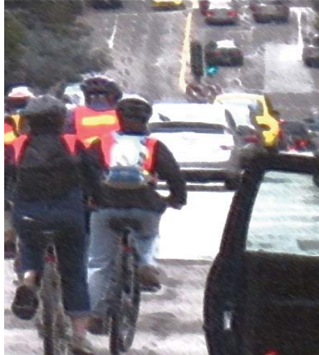
With the proper skills, riding with traffic can be much less stressful.