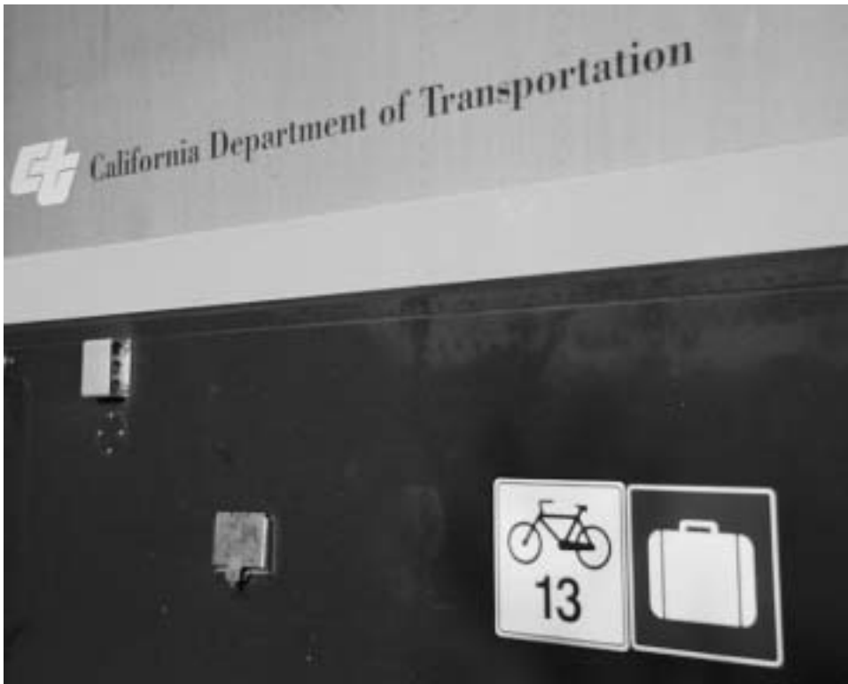
Amtrak California Cars now feature exterior signs that indicate the bike-rack capacity of each car. Regular riders on the Capital trains often secure more bikes inside using bungee cords.