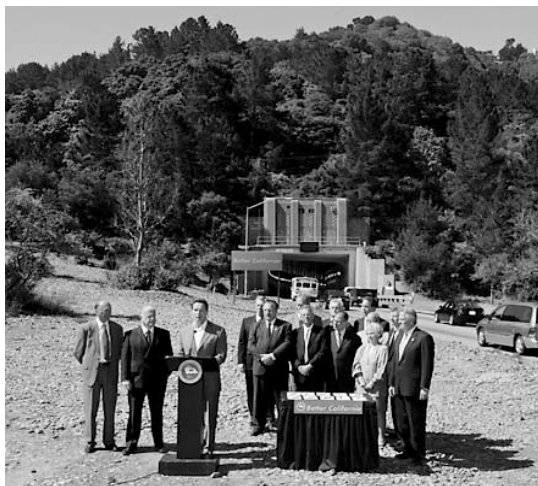
Governor Schwarzenegger and Senator Perata at the signing ceremony outside the Caldecott Tunnel