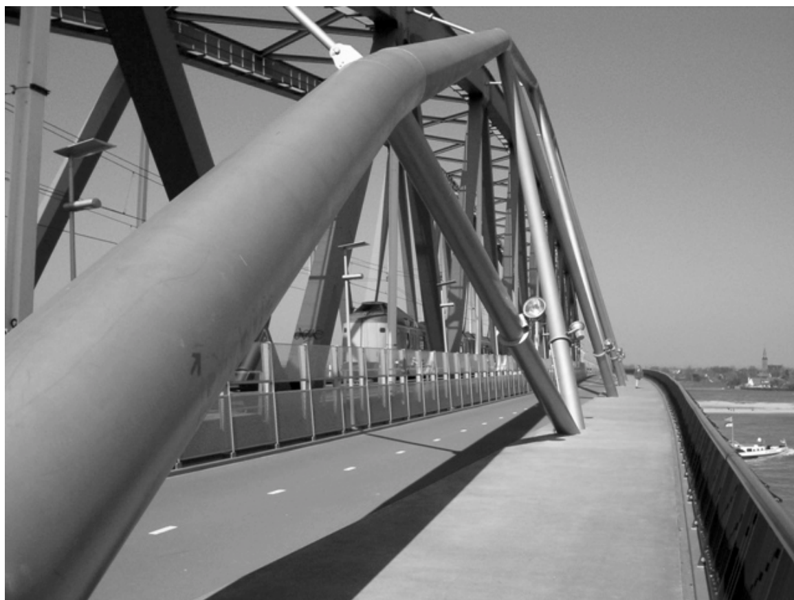
The Nijmegen railway bridge crosses the river Waal, in Holland. On the left, a passenger train can be seen crossing the bridge. On the right is a 770 foot long bike-ped bridge attached to the existing railway bridge in 2004.

NEXT MEETING begins on Tuesday, September 19 with a Board Meeting at 7:00pm, followed by General Membership Meeting at 7:30pm at the Rockridge Branch of the Oakland Public Library, 5366 College Ave at Manila.