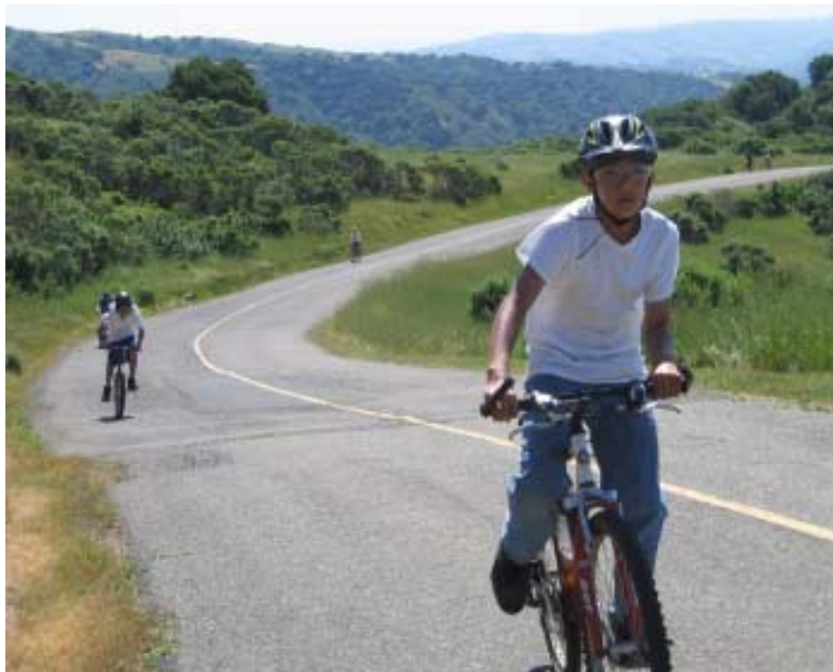
Cycles of Change bike ride

This summer Cycles of Change is planning two bicycle tours. The first is a 7-day ride exploring the Lake Tahoe area. Five staff and 15 students will tour the paths surrounding the lake, and enjoy the 4th of July fireworks display from the lake's beautiful shores. This will be