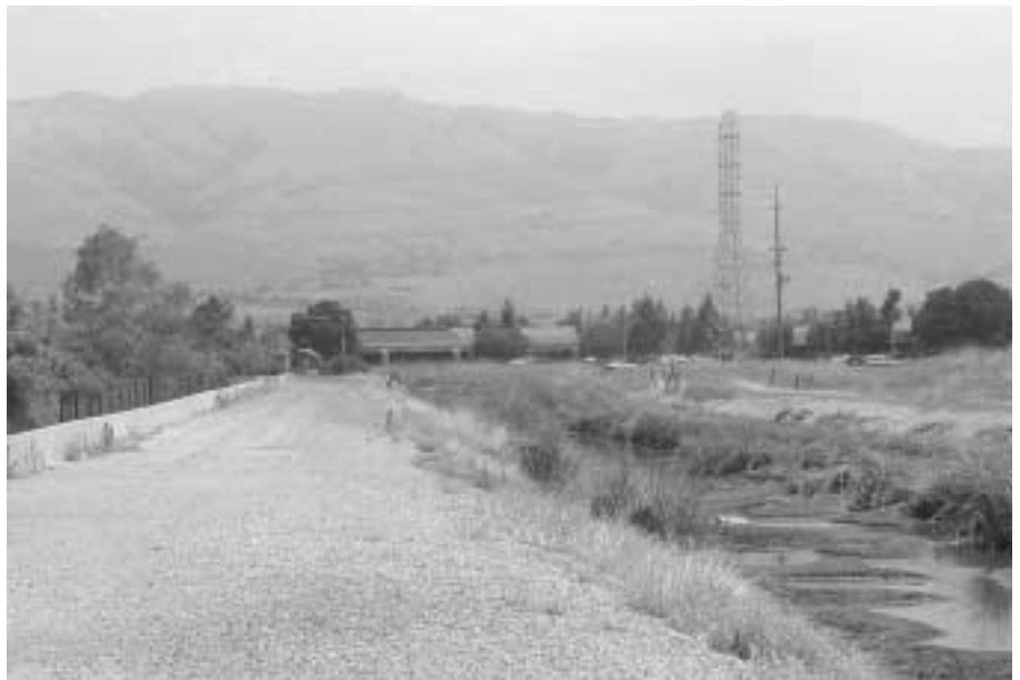
View to the east along the north bank of the flood control channel from a point just south of the end of Fremont Blvd. I880 is in the distance; the gravel path on both sides of the channel is in good condition.