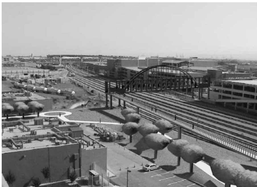
Proposed Bay St. bike/ped bridge in Emeryville

Submissions to ebbc-talk are archived at http://www.ebbc.org/list.html .