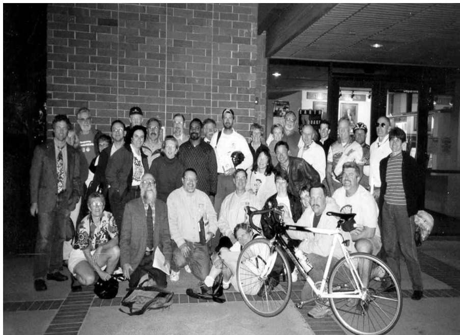
Delta Force Advocate Pedalers - All smiles following successful Antioch City Council session on April 28 to keep bike lanes on Lone Tree Way.

[Oil imports are also a major contributor to the US trade deficit.]