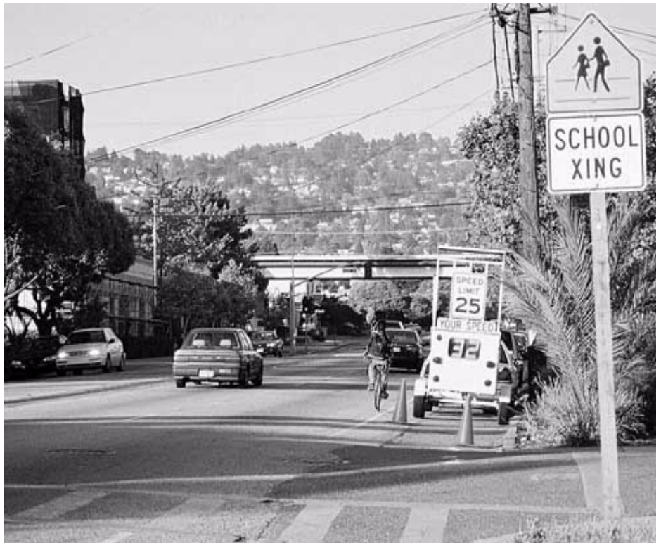
Unidentified bicyclist squeezes past parked cars and police radar on Albany's Marin Avenue toward the BART structure and Berkeley Hills on July 1, 2002. That evening, the Albany City Council unanimously voted in favor of a "Road Diet" proposal to make room for bicyclists and enhance pedestrian safety.

As shown in the diagram below, four lanes will be reduced to 2 lanes with a center turn lane, leaving plenty of space for bike lanes.