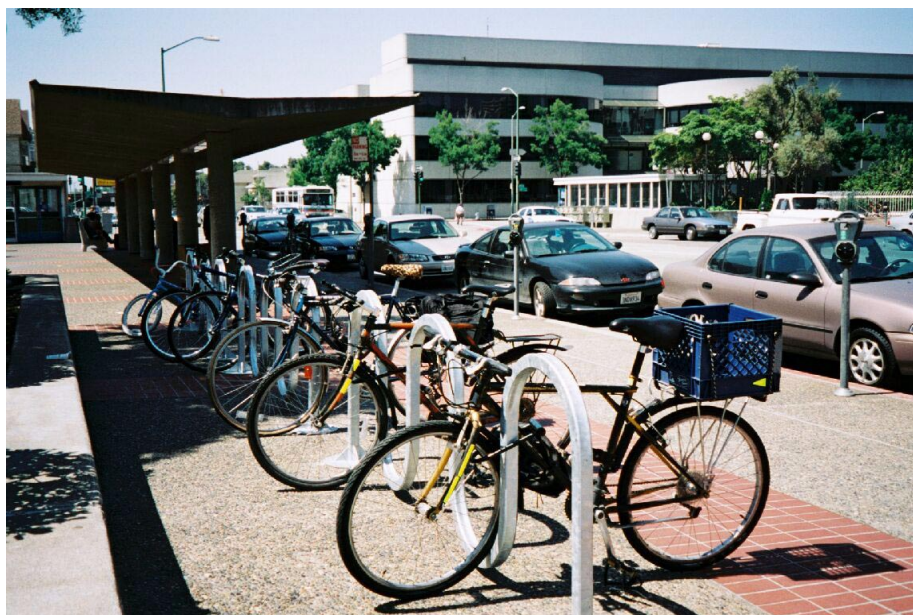
Recent Lake Merritt wavebend rack installation.

[A June 7th editorial in the Chronicle urged the construction of more parking garages at BART stations. -ed]