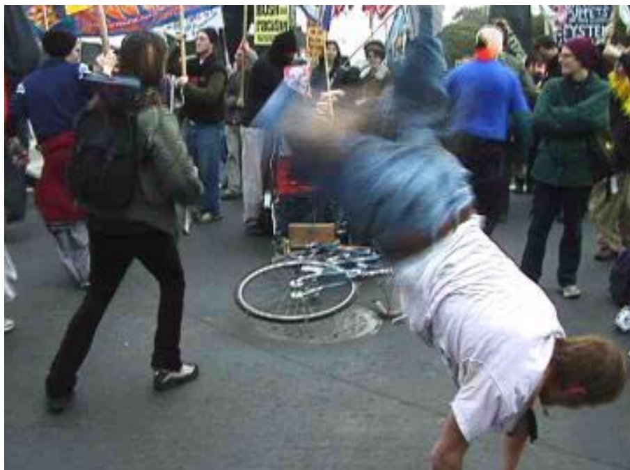
San Francisco RTS demonstration, January 20, 2001.

The tactic rapidly caught on, and RTS street parties have been carried out in cities all over the world, including Berlin, San Francisco, and Berkeley. As far as anyone knows, no street party has ever resulted in bombings, poison gas, or any other bodily harm, though some events have attracted hooligans who smashed bank windows.