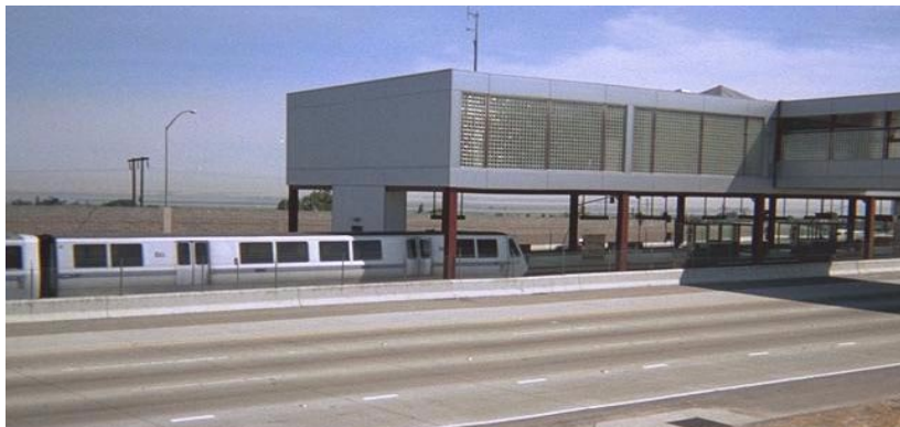
Pittsburg/Bay Point BART

The proposed Ozone Attainment Plan calls for improved emission control technology on passenger vehicles to reduce smog as well as additional regulations on refineries. The plan does not call for changes in transportation or zoning.